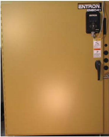
4 Cascade Control in 'G' Cabinet